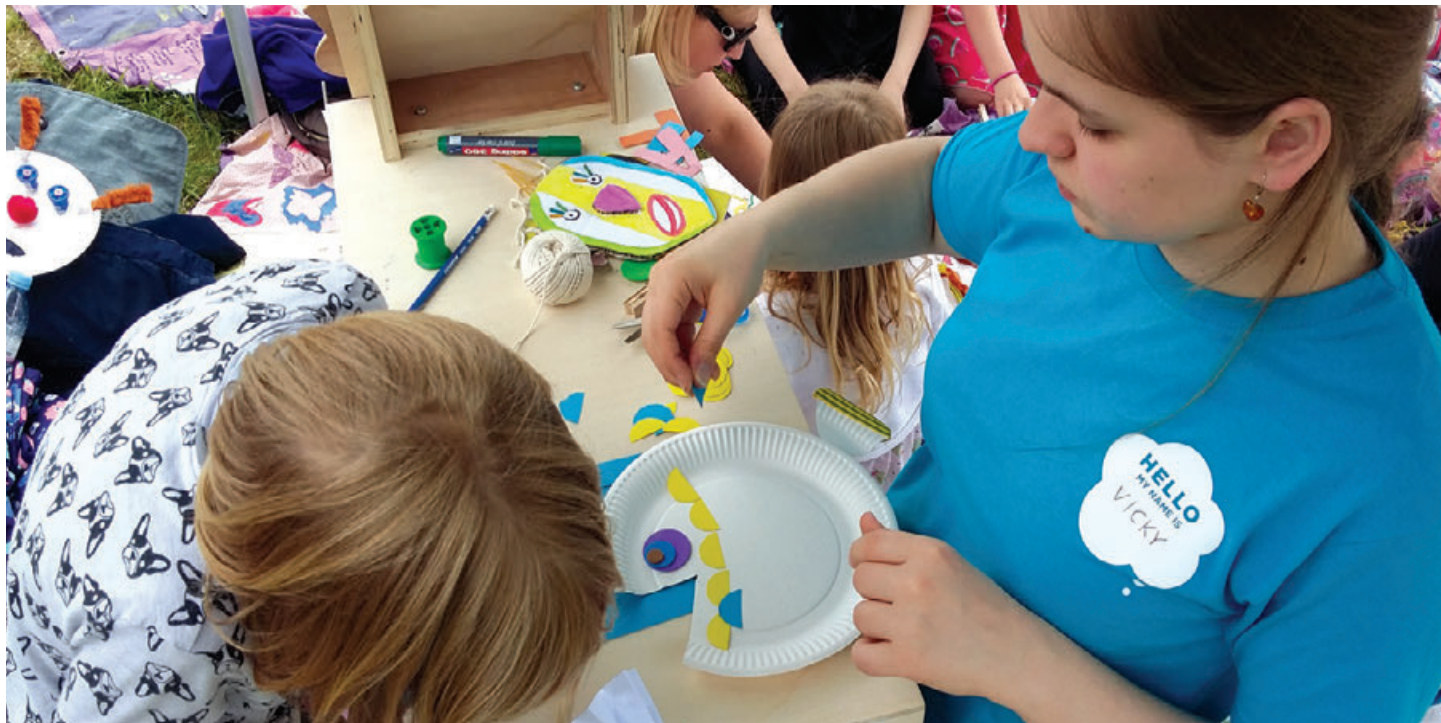
FIGMENT Derby 'On The Road'

Although there was no official FIGMENT Derby event in 2018, the team spent the season prototyping new ideas for FIGMENT Derby with a series of 'on the road' pop-up events at area community festivals. The team used the pop-ups as a way to play with new creations and develop new relationships with artists and communities—especially useful as the civic space that hosts FIGMENT is under development as the new Museum of Making at Derby Silk Mill during 2018–2020.