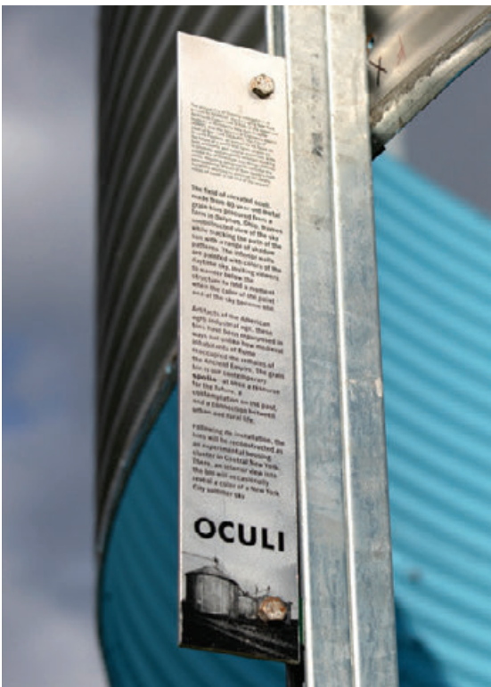
Oculi Pavilion by Austin+Mergold, City of Dreams Pavilion (with ENYA and SEaONY)