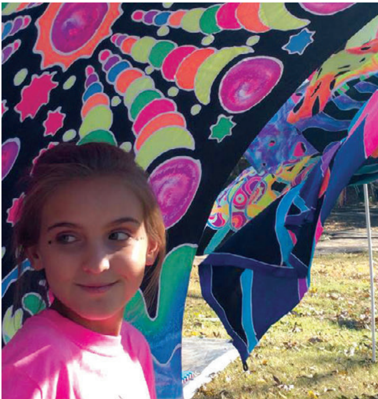
Electric Lotus