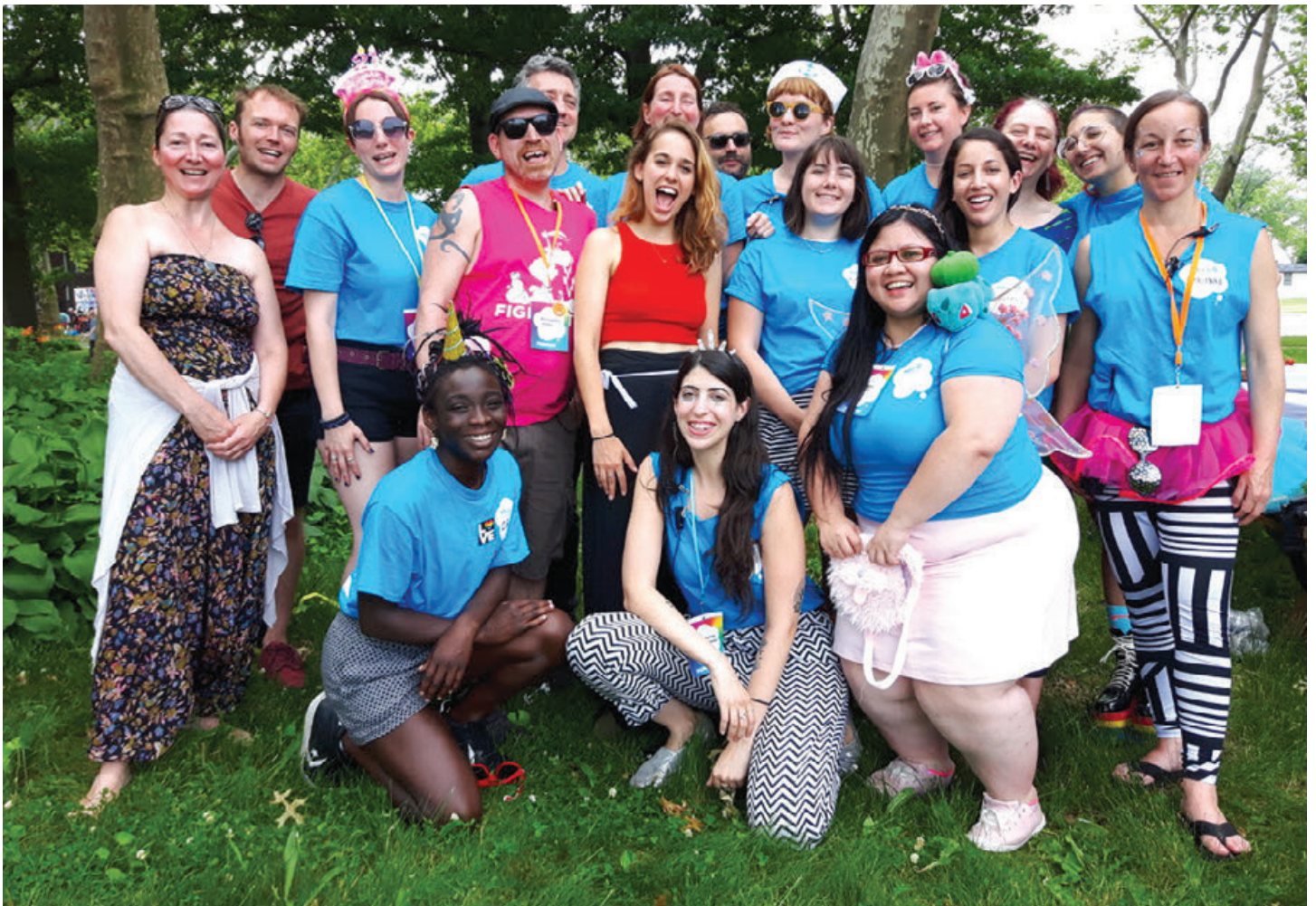
Producers Brunch at FIGMENT NYC