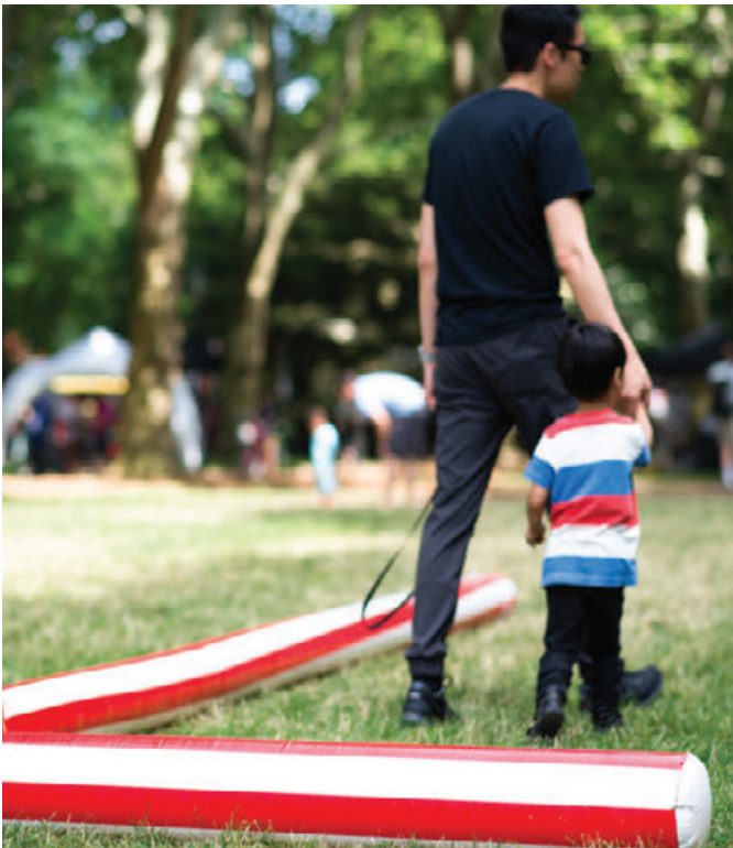
Natural Plasticity by Cruder La Penta / Jane Cruder. Dream Bigger