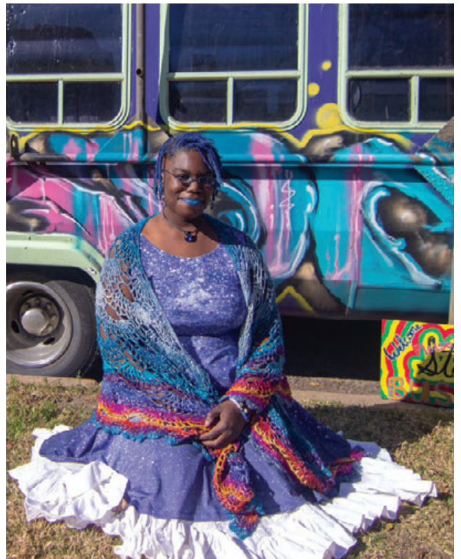
Bustacio Art Bus