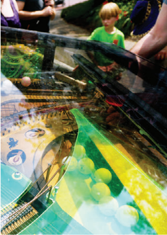
MetaPiano by Seth Vecilla and Floor van de Velde (Project MetaPiano Team)

FIGMENT Boston's ninth consecutive annual event turned The Rose Kennedy Greenway into a large-scale collaborative artwork on July 28-29. The team used tent structures to add an element of togetherness to the space, allowing artists to be close, but separate. Saturday's FIGMENT After Dark component (6-11pm) transformed Dewey Square into a dance party, a celebration of light and projection art, with many visitors bringing lit-up elements and costumes to the party.