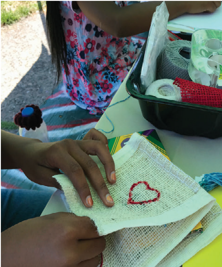
Stitch 'n Draw by Emily Wong, FIGMENT Oakland Summer Art Classes