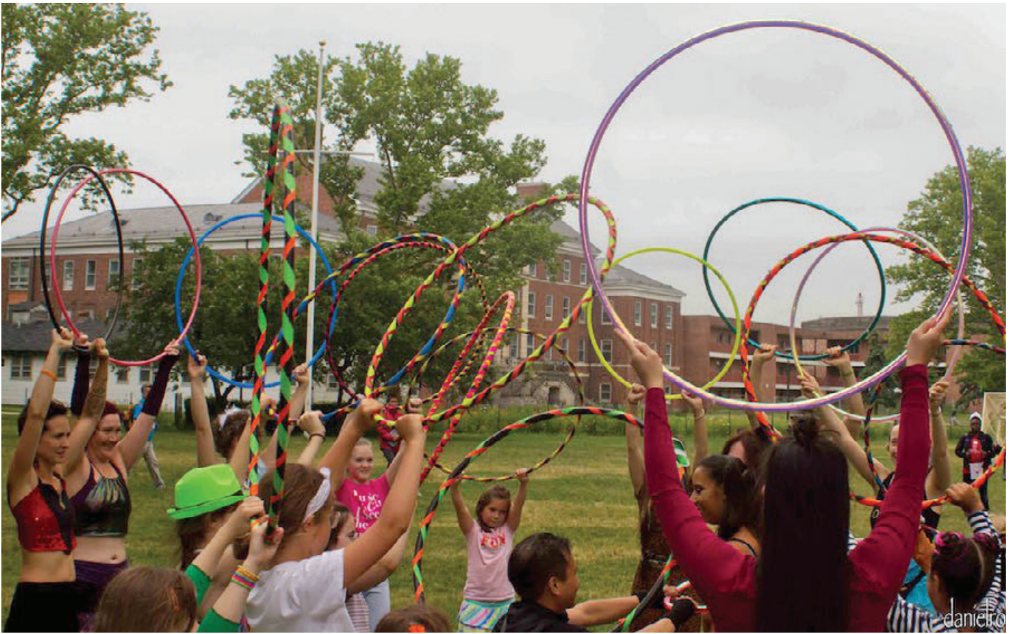
FIGMENT NYC