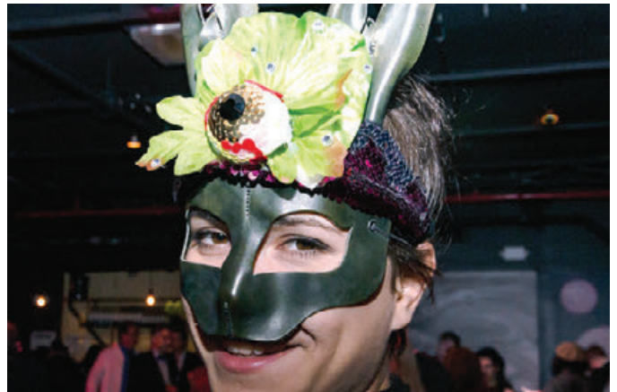
FIGMENT Global Masquerade and Fundraiser