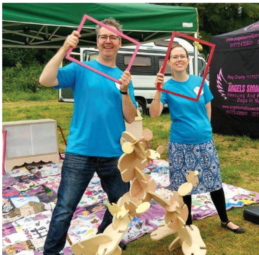
FIGMENT Derby 'On The Road'