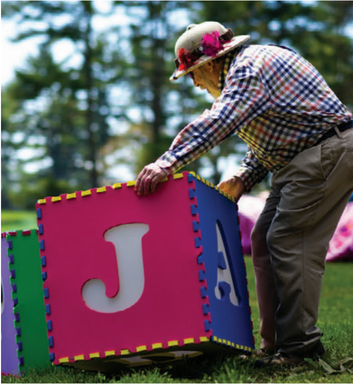
AlphaBlocks by NDWYCO

Our sixth annual ticketed camp-out event for makers, creators, and artists, continued the tradition of celebrating the boldness of creative experimentation. From April 27-29, Camp Ramblewood in Darlington, MD, was a place to launch new art projects, to fail, to improve existing projects, to collaborate, dive in, and create something new, something unexpected. ALPHA is a safe space of community, openness, friendship, invention, and play—equally invested in teaching and learning.