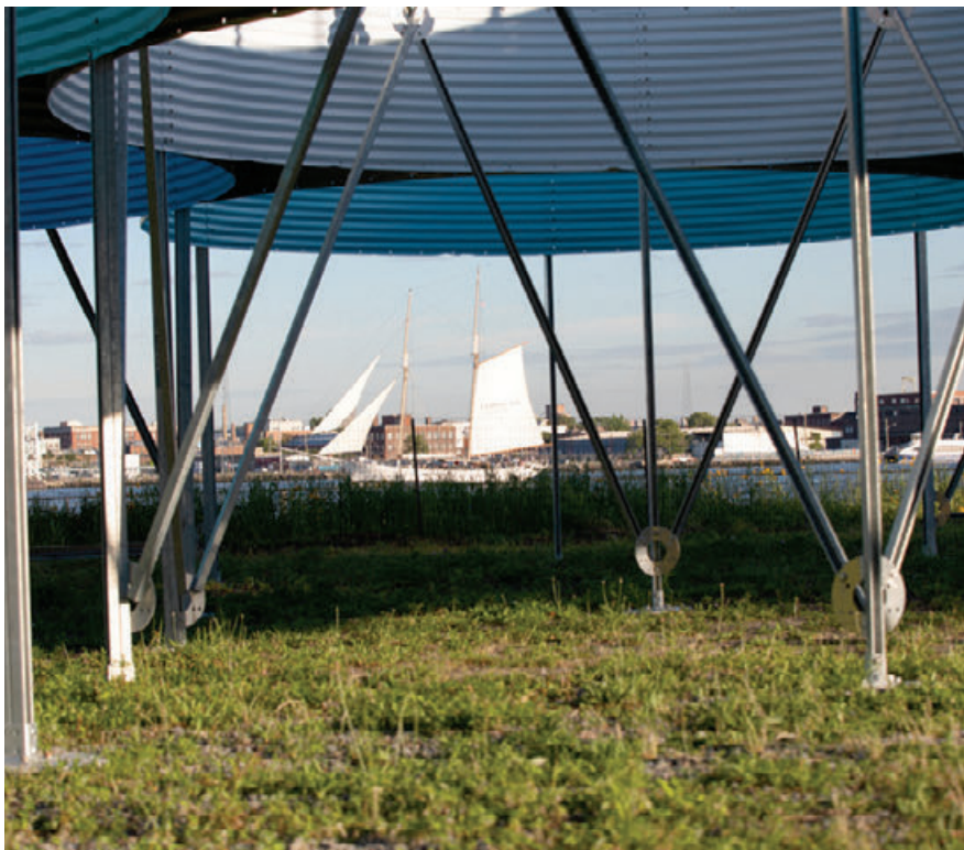
Oculi Pavilion by Austin+Mergold, City of Dreams Pavilion (in collaboration with ENYA and SEaONY)