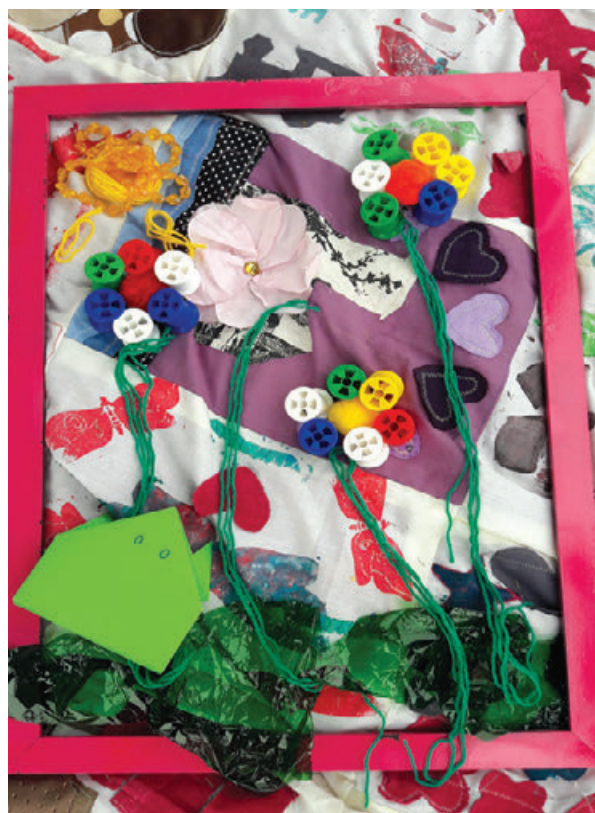
FIGMENT Derby 'On The Road'