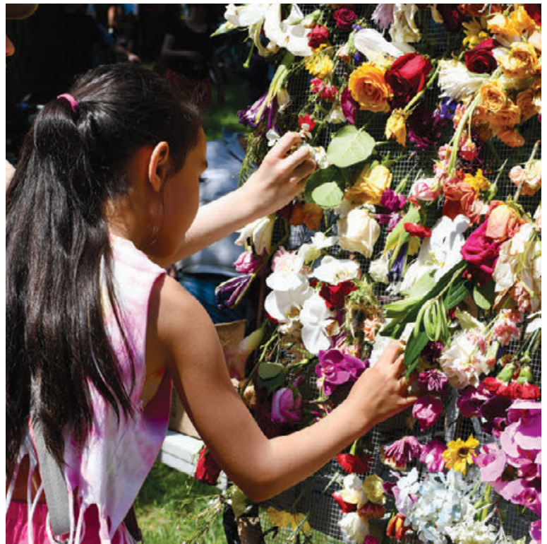
Flower Mosaic by Neal Flowers