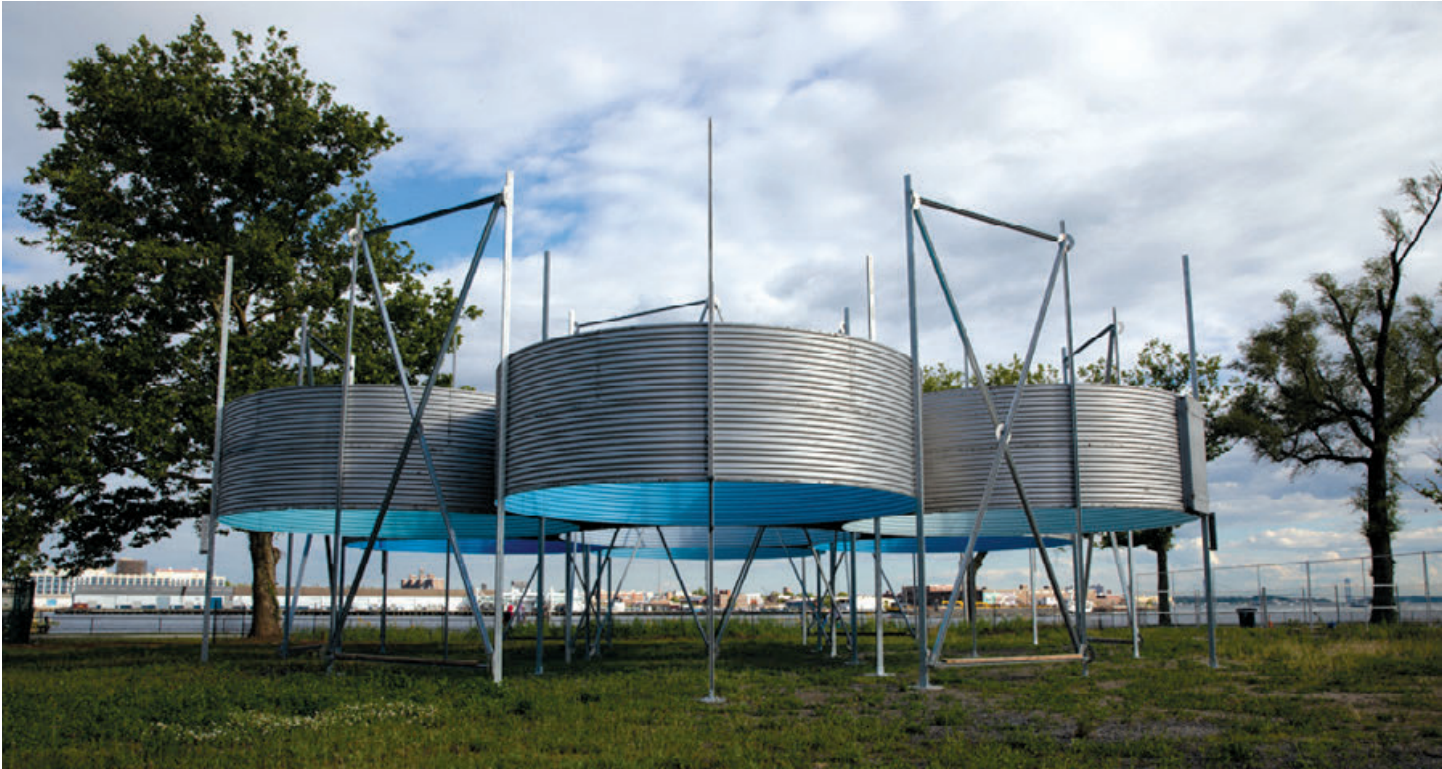
Oculi Pavilion by Austin+Mergold, City of Dreams Pavilion (in collaboration with ENYA and SEaONY)