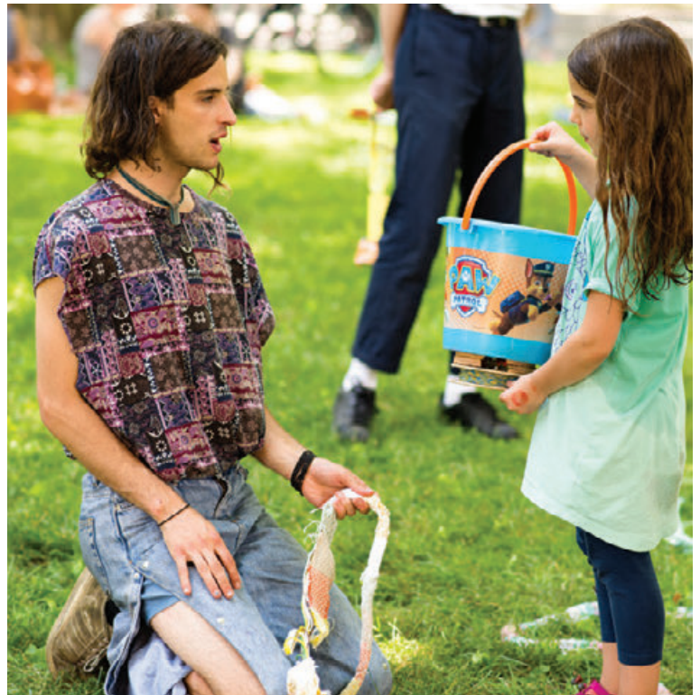
The Dynamic Listening Instrument by Callan Fish. Dream Bigger