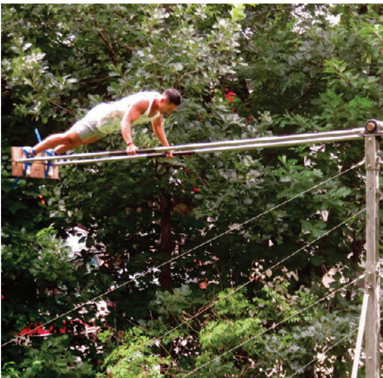
The Moon Shot by Matt Culver