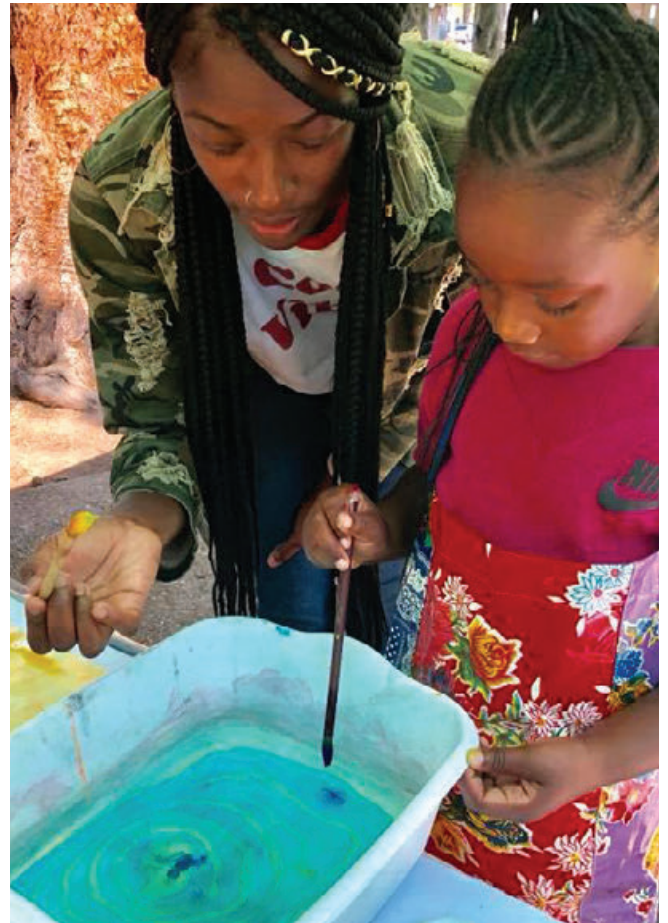
Japanese Paper Marbling by Jess Henricks, FIGMENT Oakland Summer Art Classes / © 2018 Jess Henricks