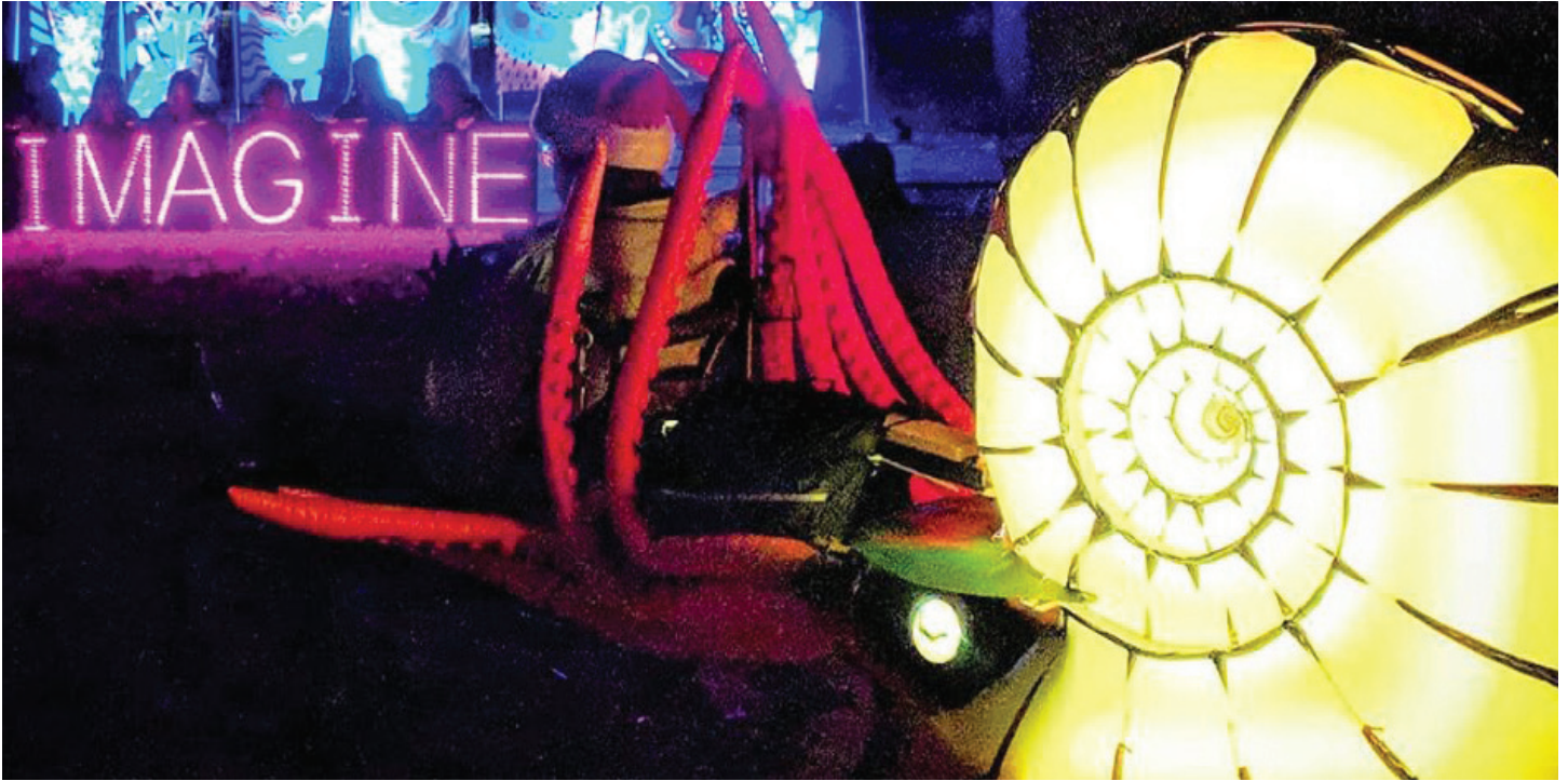
Fossycycle with NTLB

For the first time ever, FIGMENT went to Texas in 2018! Over 30 artists, interactive public art pieces, musical acts, games, sculpture, immersive environments, and more came together at Reverchon Park in Dallas on Saturday, December 1. Visitors were encouraged to bring their picnic basket, decorate their stroller or bike—and costume up! FIGMENT Dallas began in the morning, but went into the evening hours allowing for illumination and light art projects.