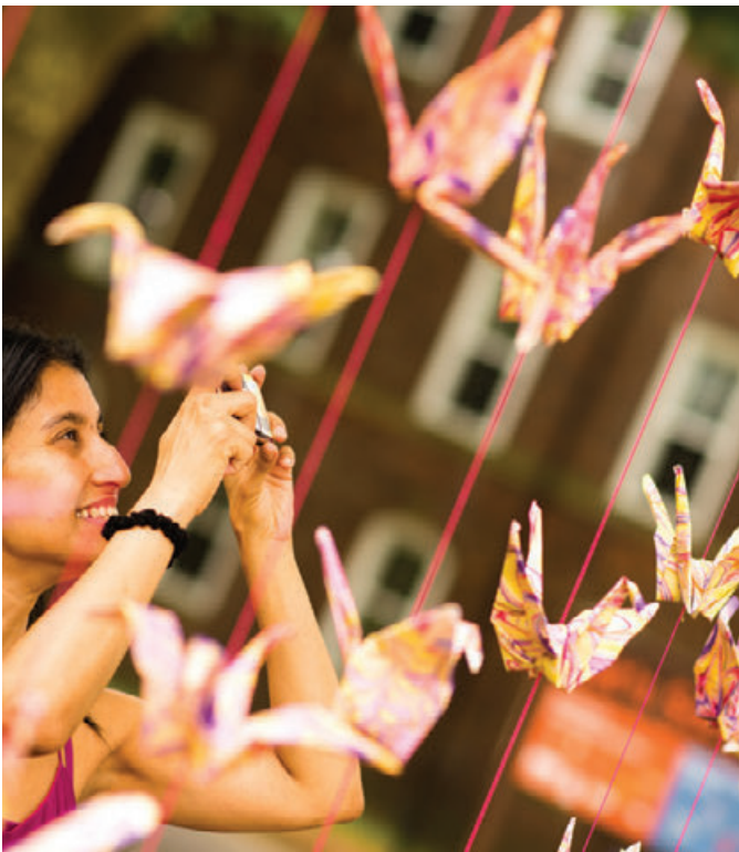
Flights of Fantasy by Helen Chin