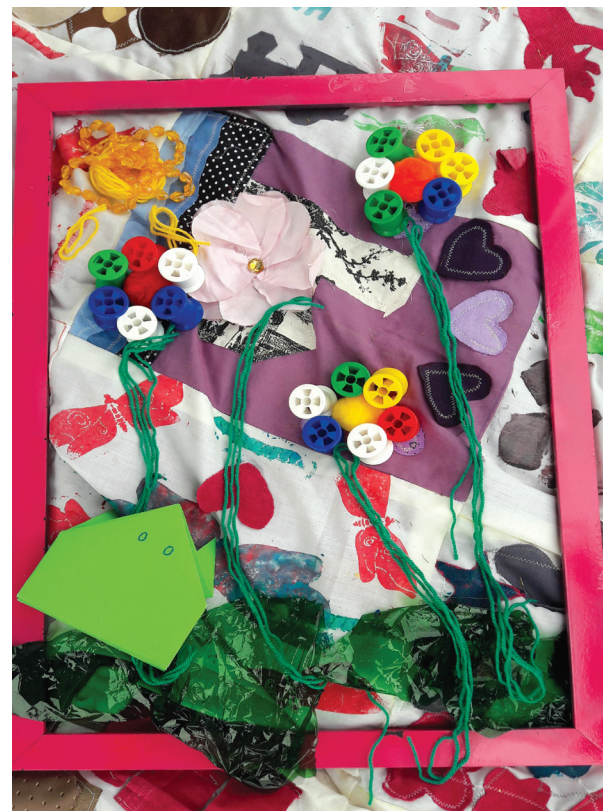
FIGMENT Derby 'On The Road'