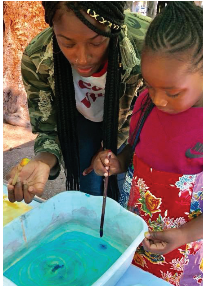
Japanese Paper Marbling by Jess Henricks, FIGMENT Oakland Summer Art Classes / © 2018 Jess Henricks