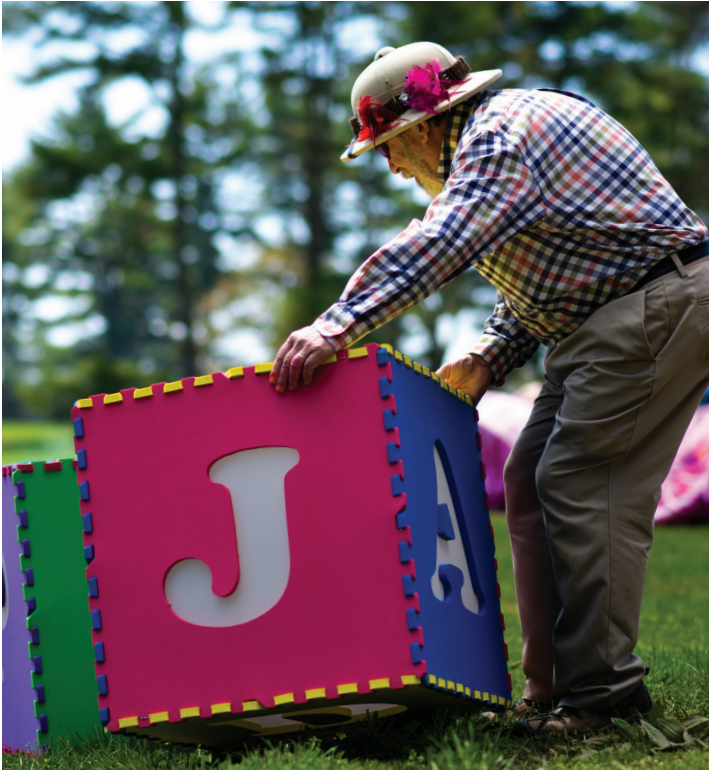
AlphaBlocks by NDWYCO

Our sixth annual ticketed camp-out event for makers, creators, and artists, continued the tradition of celebrating the boldness of creative experimentation. From April 27-29, Camp Ramblewood in Darlington, MD, was a place to launch new art projects, to fail, to improve existing projects, to collaborate, dive in, and create something new, something unexpected. ALPHA is a safe space of community, openness, friendship, invention, and play—equally invested in teaching and learning.