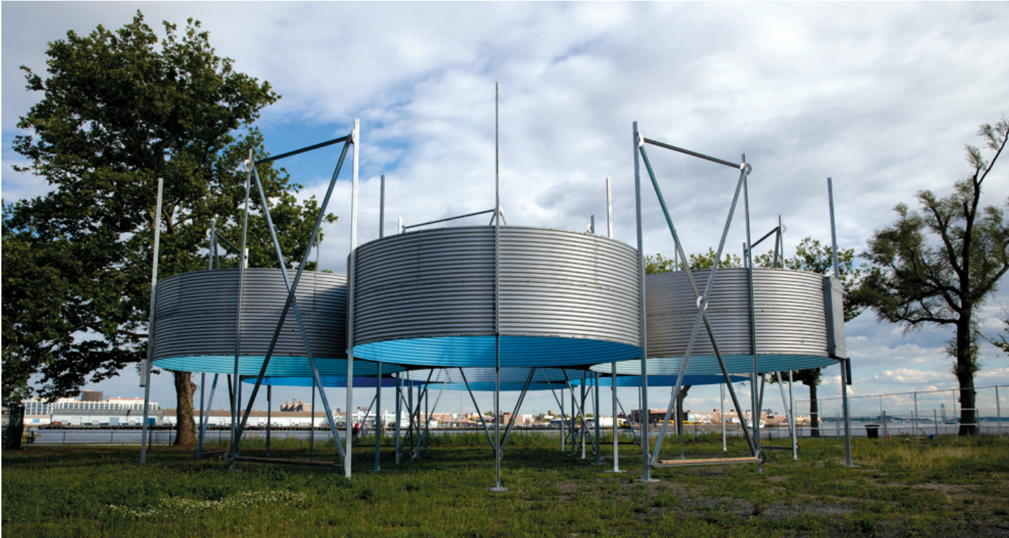
Oculi Pavilion by Austin+Mergold, City of Dreams Pavilion (in collaboration with ENYA and SEaONY)