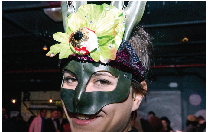
FIGMENT Global Masquerade and Fundraiser