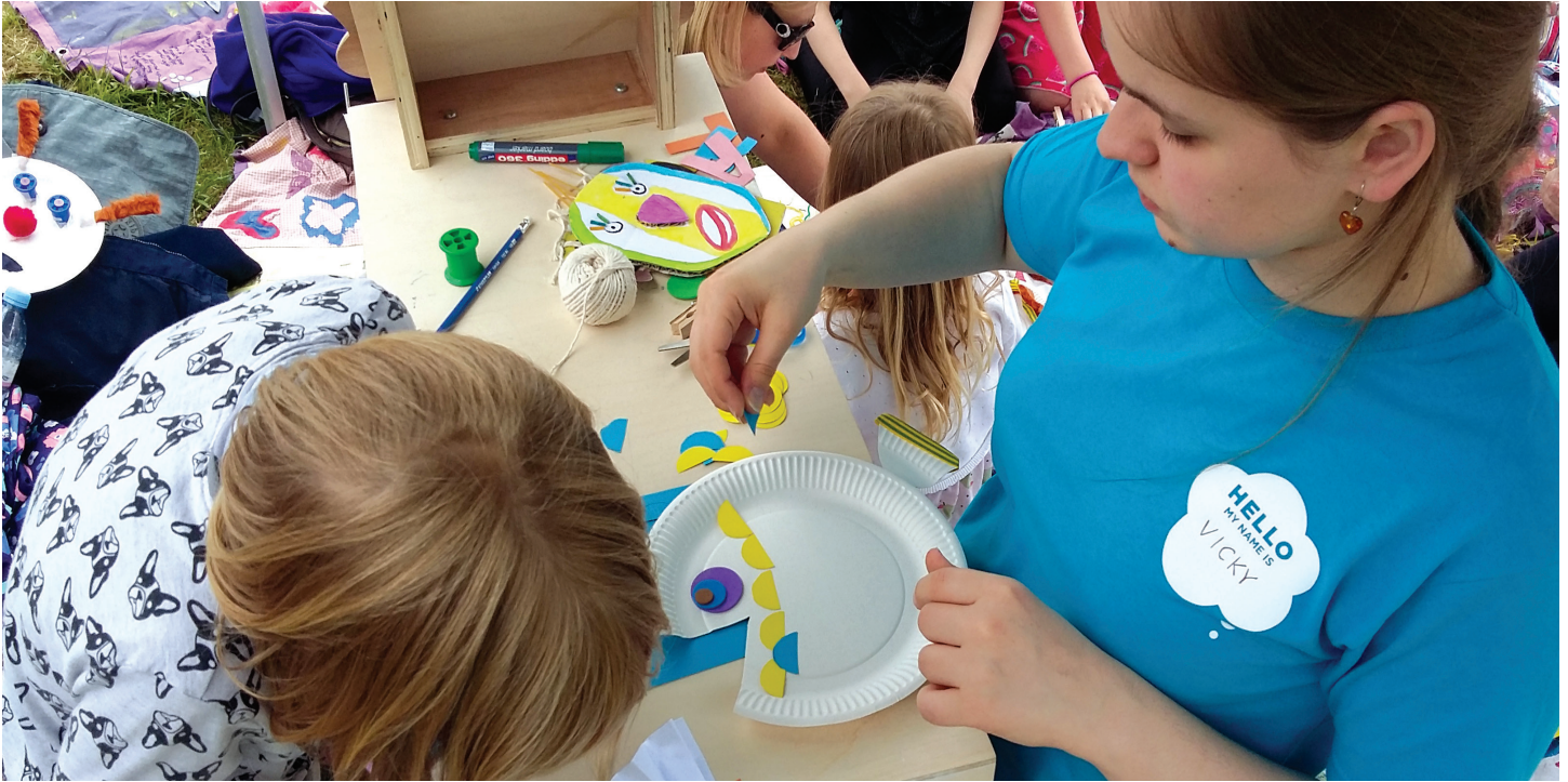
FIGMENT Derby 'On The Road'

Although there was no official FIGMENT Derby event in 2018, the team spent the season prototyping new ideas for FIGMENT Derby with a series of 'on the road' pop-up events at area community festivals. The team used the pop-ups as a way to play with new creations and develop new relationships with artists and communities—especially useful as the civic space that hosts FIGMENT is under development as the new Museum of Making at Derby Silk Mill during 2018–2020.