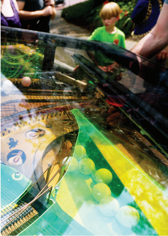
MetaPiano by Seth Vecilla and Floor van de Velde (Project MetaPiano Team)

FIGMENT Boston's ninth consecutive annual event turned The Rose Kennedy Greenway into a large-scale collaborative artwork on July 28-29. The team used tent structures to add an element of togetherness to the space, allowing artists to be close, but separate. Saturday's FIGMENT After Dark component (6-11pm) transformed Dewey Square into a dance party, a celebration of light and projection art, with many visitors bringing lit-up elements and costumes to the party.